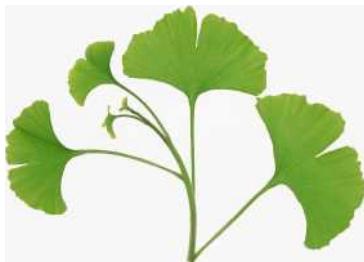
Ginkgo Ginkgo biloba

Besides dementia, Ginkgo may also be useful in treating leg pain, discomfort, tiredness and limping.