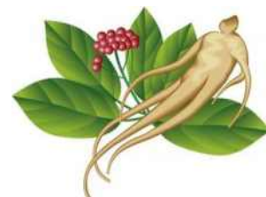
Ginseng, Siberian Eleutherococcus senticosus

Antioxidants help fight free radicals—rogue molecules that attack cells and cause them to mutate. Free radicals weaken the body . . . damage DNA . . . and contribute to the development of many diseases, including cancer. See page #.