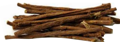
Licorice Glycyrrhiza glabra

As a potent antiviral agent, Licorice is effective against even the severe acute respiratory syndrome (SARS).