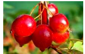
Hawthorn Crataegus (species)

The plant is also used to treat various digestive ailments, atherosclerosis and age-related conditions. Hawthorn is also a free-radical scavenger, combats inflammation, protects the gastrointestinal system and fights disease-causing microbes.