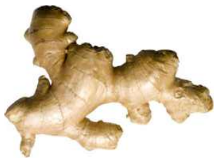
Ginger Zingiber officinale

Besides being a staple ingredient in Asian food, Ginger is also used as a medicine in Traditional Chinese Medicine, Ayurveda and Unani.