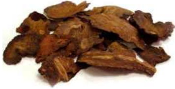
Ho Shou Wu/Fo-Ti Fallopia multiflora

A lesser-known herb, Ho Shou Wu is neither a much-used one nor a common ingredient in herbal preparations. It is found in only a few supplements available in the United States. Legends associate Ho Shou Wu with long life and even immortality.