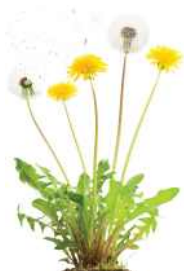
Dandelion Taraxacum officinale