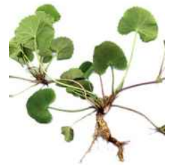
Gotu Kola Centella asiatica

Gotu Kola is also used to treat anxiety . . . pain . . . depression and other mental disorders . . . viral and fungal infections . . . hardening and narrowing of the arteries (atherosclerosis) . . . asthma . . . tuberculosis . . . skin lesions . . . lupus . . . poor memory . . . psoriasis . . . and to strengthen the immune system.