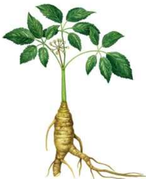
Ginseng Panax ginseng

Panax Ginseng is one of the most commonly used ginsengs.