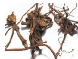
Sarsaparilla Smilax officinalis

Sarsaparilla helps the gastrointestinal tract absorb nutrients better.