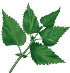
Nettle Urtica dioica

Nettle relieves lower urinary tract symptoms such as weak urine flow . . . painful and difficult urination . . . incomplete emptying of the bladder . . . the increased need to urinate at night . . . dribbling . . . and genital discomfort.